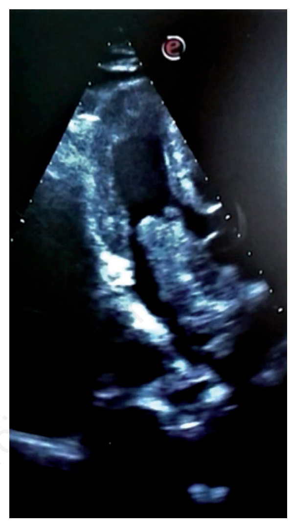
Figure 2. Apical three-chamber view of atrial sarcoma.