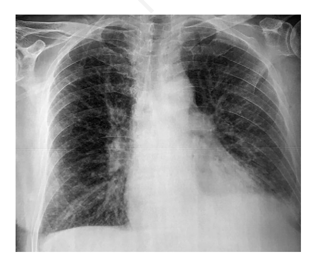
Figure 1. Chest X-ray.

Signs and symptoms of intra cardiac mass are nonspecific and highly variable in relation to localization, size and composition of the cardiac mass. Generally, clinical presentation includes pulmonary or systemic