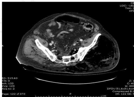
Figure 2. Gas material in left gluteus.