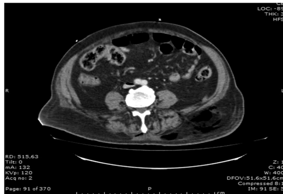
Figure 1. Gas material in lumbar-sacral area.

Goh et al. 5 made a systematic review about NF.