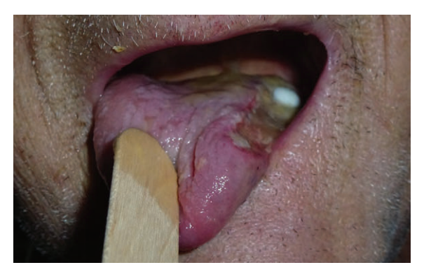
Figure 3. Improvement of trophic lesions of the tongue.