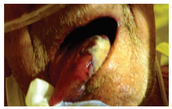
Figure 1. Infarction of the left side of the tongue.

ical and instrumental elements, even if temporal artery biopsy, represents the gold standard for diagnosing GCA.<sup>6</sup> It should be pointed out, however, that the clinical assessment is very important. The American College of Rheumatology criteria for the diagnosis of GCA include, besides a positive temporal artery biopsy, an age over 50 years, a new appearance of any type of head pain, abnor-