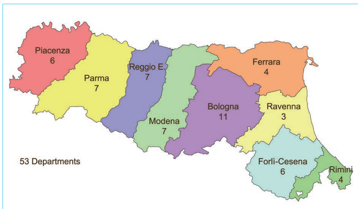
Figure 1. Geographical distribution of internal medicine departments which participated in the survey.

As to the data on the organization, reports on the antibiotic therapy are available only in 47.1% of the cases with a significantly higher score in large hospitals than in smaller ones (60.7% vs 28% P < 0.05 ). Unfortunately these reports focus exclusively on economic aspects (61.5%) rather than prescription appropriateness. However, they are computerized