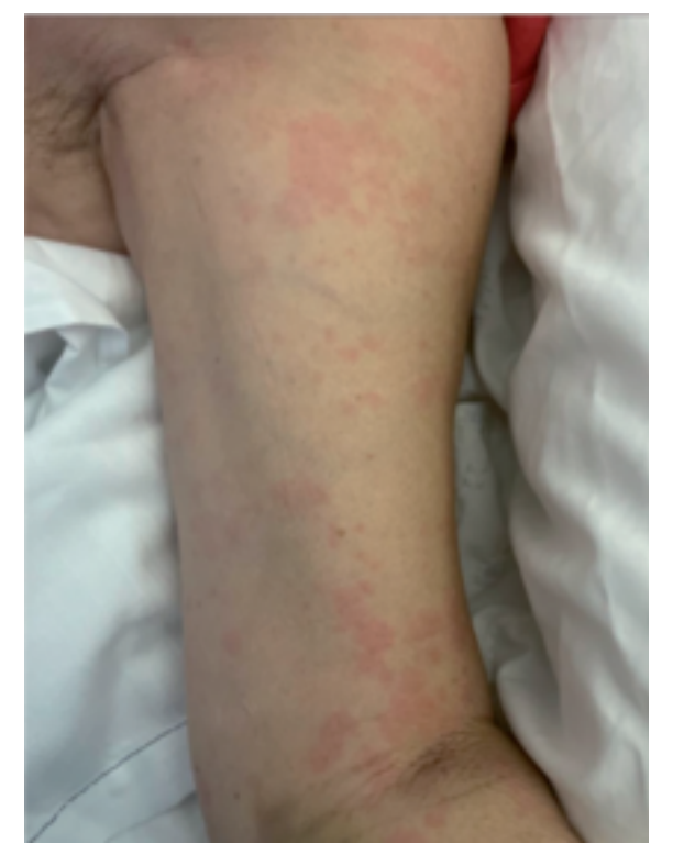
Figure 2. Salmon-like rush.